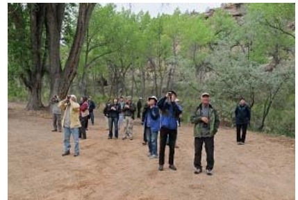
Field trip participants

Then we went back to Devil's Kitchen. We got there at sunrise. We saw hoodoos. They looked like bottles and