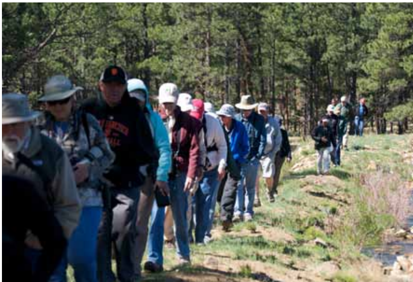
Birders head out in search of American Three-toed Woodpeckers at the Vermejo Park Ranch in New Mexico during the 2012 CFO Convention.