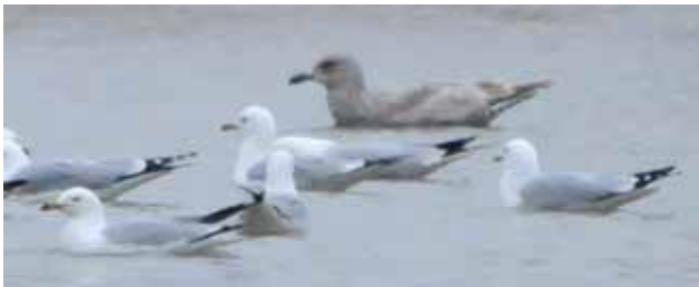
Fig. 2a: First-cycle Herring x Glaucous-winged Gull, Drake Lake, Weld County, 6 Apr 2011.