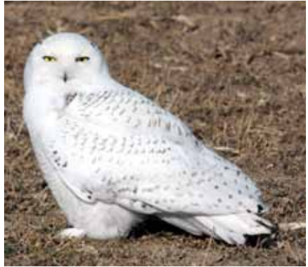
Snowy Owl, CR 12, Prowers, Jan 2012.