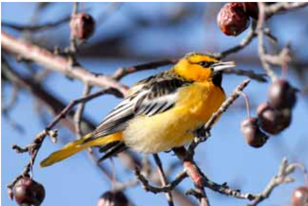
Bullock's Oriole, Fort Collins, Larimer, 2 Jan 2012.