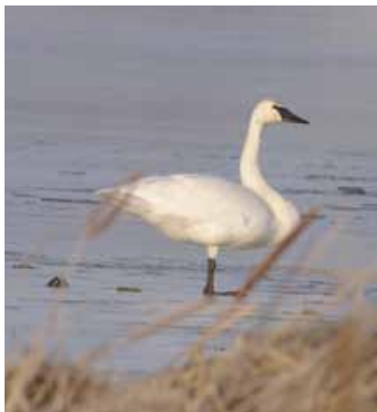
Trumpeter Swan, Cattail Ponds, Larimer, 4 Jan 2012.

Tundra Swan: All reports: 2 at Confluence Park Delta 3-17 Dec (DG); 6 in Montrose Montrose on