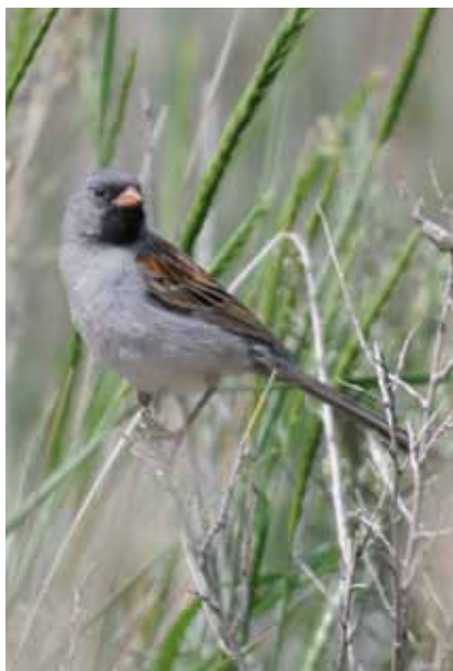
Black-chinned Sparrow, Colorado National Monument, Mesa, 20 May 2011. Photo by Bill Schmoker