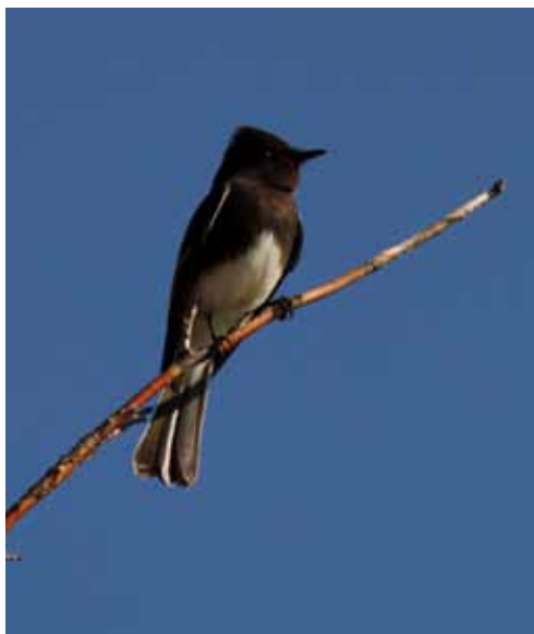
Black Phoebe, Arkansas River, Pueblo Reservoir State Park, Pueblo, 25 Jan 2012.

2011; photographs of it on Facebook eventually alerted the birding community.