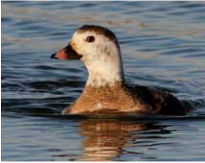
Long-tailed Duck , Tinseltown Pond, El Paso, 16 Dec 2012.

and 1 male at Rawhide Power Plant Larimer on 26 Dec (SM); 1 at Denver City Park Denver continuing from the fall season through at least 3 Jan (LK, GW, KH, m.ob.); 1 female at Ruedi Res. Eagle on 11 Jan (SF); 1 at Brush Hollow Res. Fremont 18-20 Jan (SeM, BKP); 1 at Grand Junction Mesa 5-25 Feb (LA).