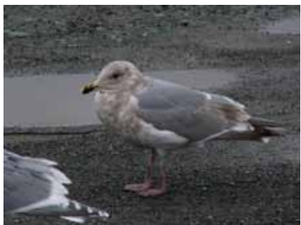
Fig. 5: Immature (second- or third-cycle) Herring x Glaucous-winged Gull, Ketchikan, Alaska, 20 February 2007.