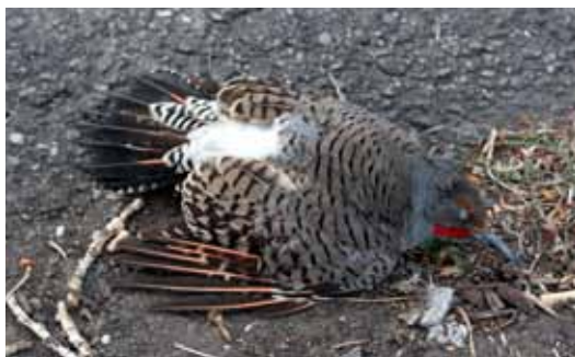
The victim of fatal agonistic behavior between two Northern Flickers at City Park in Fort Collins, Larimer County, 25 March 2012.

the onset of observation, one clearly had the better of the bout. This bird had one foot embedded in the upper back feathers of the other, with its second foot out of view on the ground. As the aggressor held down the lower individual, it pecked steadily and repeatedly at the back of the disadvantaged bird's head. About every 30 seconds, the pecking bird rested, while the bird being pecked panted and/or screamed. The only other times I have heard this same scream are when flickers are being pursued or captured by accipiters.