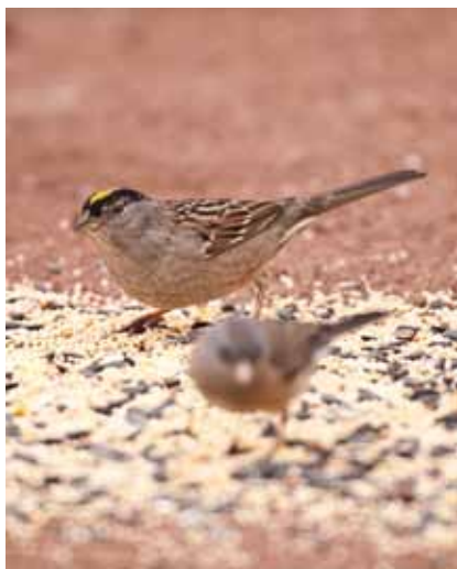
Golden-crowned Sparrow, Red Rocks Trading Post, Jefferson, 30 Jan 2012.