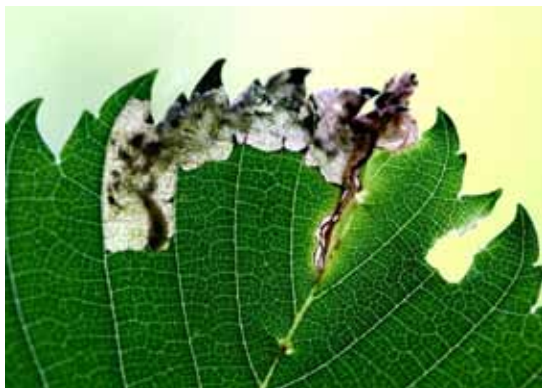
Fig. 1. European Elm Flea Weevil larval mine in the tip of an American Elm leaf. Note the nearly fully-grown, banana-shaped larva visible at the lower left edge of the brown leaf mine (dark mandibles pointed downward).