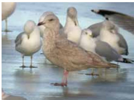
Fig. 3: Colorado's first Herring x Glaucous-winged Gull, Prince Lake #1, Boulder County, 13 Jan 2004.