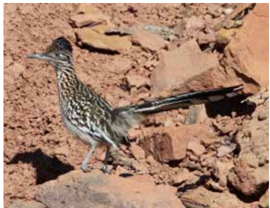
Greater Roadrunner, Dinosaur Ridge, Jefferson, 20 Jan 2012.