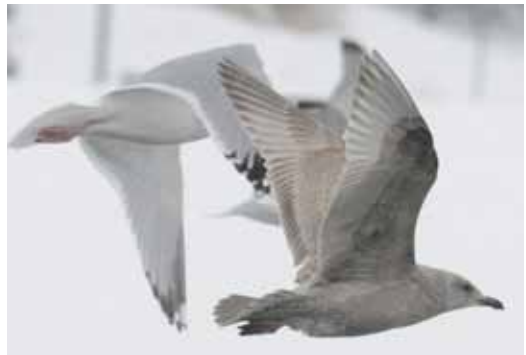
Fig. 1b: The bird from Fig. 1a in flight.