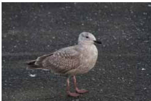
Fig. 6: First-cycle Herring x Glaucous-winged Gull, Ketchikan, Alaska, 12 February 2012.