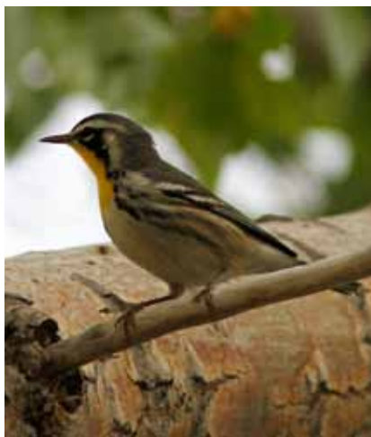
Yellow-throated Warbler, Chico Basin Ranch, Pueblo, 13 Sep 2011.