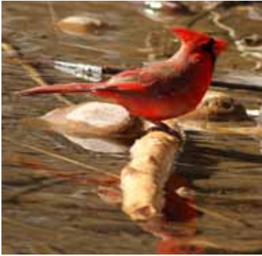
Northern Cardinal, Arkansas River, Pueblo Reservoir State Park, Pueblo, 25 Jan 2012.