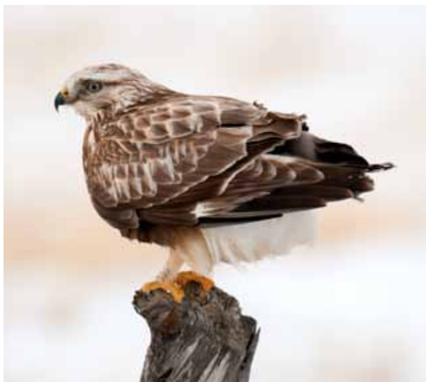
Rough-legged Hawk, Arapaho NWR, Jackson, 25 Feb 2012.

Mew Gull: All reports: 1 adult at Pueblo Res. Pueblo on 8 Dec (BKP, MJ); 1 adult at Lake Minnequa Pueblo