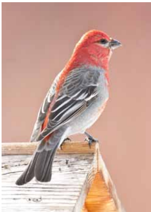
Pine Grosbeak , Moose Visitor Center, Jackson, 25 Feb 2012.

birds at Valco Ponds/Rock Canyon Pueblo from 2 Dec to 1 Jan (BKP, DN).