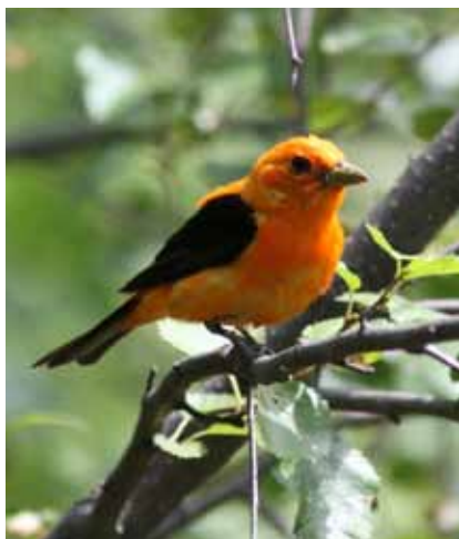
Orange variant Scarlet Tanager, North Cheyenne Canyon, El Paso, 8 Aug 2011.