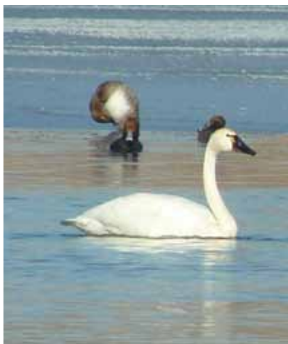
Tundra Swan, Walden Ponds, Boulder, 16 Feb 2012.

17 Dec (MS); 3 in Nucla Montrose on 22 Dec (CD, BW); 1 at Greenlee Preserve Boulder 29 Dec (TF et al.); 1 adult at Valmont Res. Boulder on 4 Feb (TF, SM et al.); 1 adult at Walden Ponds Boulder 21-25 Feb, likely the same individual as the Valmont bird (TF, SM, m.ob.); and 3 adults and 1 juvenile at Lathrop SP Huerfano on 26 Feb (PN).