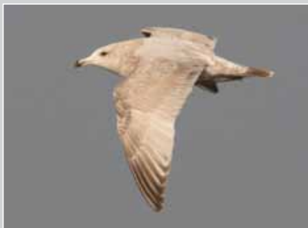
Fig. 7: Second-cycle Herring × Glaucous-winged Gull, Elwha River Mouth, Washington, 28 October 2011.