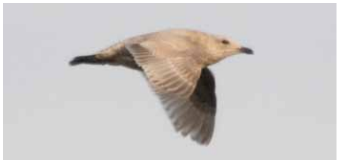
Fig. 2b: The bird from Fig. 2a, same location, 8 Apr 2011.