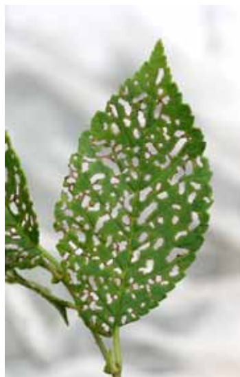
Fig. 3. Siberian Elm leaf in late summer at Grandview Cemetery showing the result of heavy European Elm Flea Weevil adult feeding. Note that this leaf did not have any mining by larval weevils.

Other species observed over the last two years eating weevil larvae in elm leaf mines in May in Colorado include Rose-breasted Grosbeak, Evening Grosbeak, Chipping Sparrow, Western Kingbird, Lazuli Bunting, Worm-eating Warbler (Dave Ely, 14 May 2012, Chico Basin Ranch), Western Tanager, Bullock's Oriole, and House Sparrow. Seeing the kingbird feeding in this manner was surprising to me; it appeared to be a copycat type of activity, as if the kingbird was observing other birds feeding this way and thinking "there must be something to it". I also think Brewer's Sparrows were feeding on larvae in mines in