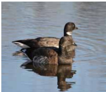
Brant, Chatfield Reservoir, Jefferson, 18 Dec 2011.