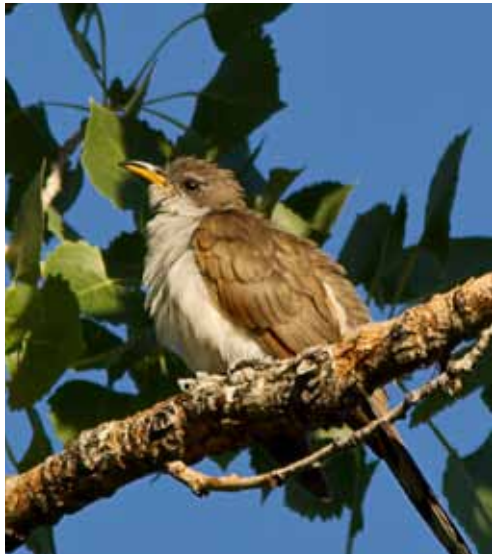
Fig. 1. Yellow-billed Cuckoo, Old Hotchkiss Water Treatment Plant, Delta County, 13 Aug 2011.

It is difficult to locate information regarding the historical distribution of the Yellow-billed Cuckoo in western Colorado. In the 1950s and 1960s, Yellow-billed Cuckoos were found annually in Palisade along the Colorado River east of Grand Junction