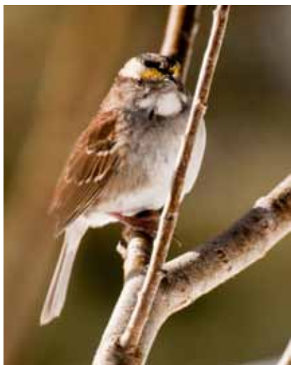
White-throated Sparrow , Moose Visitor Center, Jackson, 25 Feb 2012.

winter: 1 female at Valco Ponds SWA Pueblo on 2 Dec (BKP).