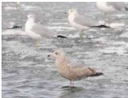
Fig. 4: Second-cycle Herring x Glaucous-winged Gull, Siena Pond, Broomfield County, 14 Jan 2012.