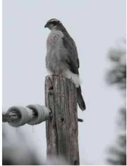
Northern Goshawk, Crestview Estates, Boulder, 12 Feb 2012.