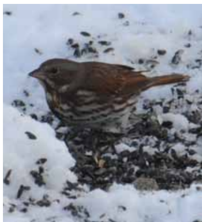
"Red" Fox Sparrow, Crestview Estates, Boulder, 8 Feb 2012.

Lincoln's Sparrow: Unusual in winter: 2 around the Pueblo Nature Center Pueblo 12-15 Dec (BKP); 2 in Grand Junction Mesa on 18 Dec (AD); 1 along the South Platte River near Commerce City Adams on 30 Dec (TF et al.).