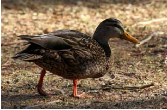
"Mexican" Mallard, Pueblo City Park, Pueblo, 25 Jan 2012.