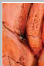
A White-throated Swift exits a nest crevice, Garden of the Gods, El Paso County, 24 April 2012.