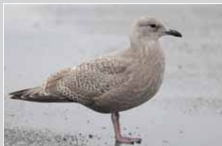
Fig. 9: First-cycle Thayer's Gull, Everett, Washington, 20 December 2010.