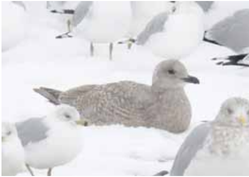
Fig. 1a: First-cycle Herring x Glaucous-winged Gull, Anthem Ponds, Broomfield County, 21 Feb 2010.