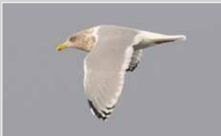
Fig. 8: Adult Herring × Glaucous-winged Gull, Elwha River Mouth, Washington, 28 October 2011.