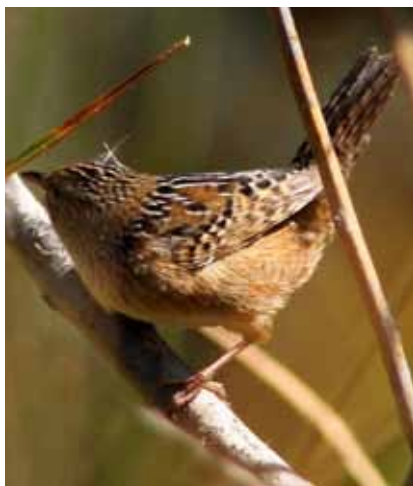
Sedge Wren, Chico Basin Ranch, Pueblo, 30 Sep 2011.