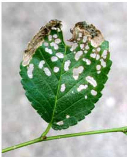
Fig. 2. Siberian Elm leaf showing European Elm Flea Weevil larval mining, beak mark due to bird predation on the larva ("V" of missing foliage at the leaf tip), and feeding holes made by adult weevils later in the summer.

rado in the last two years except for a stretch of the Arkansas River centered on Rocky Ford.