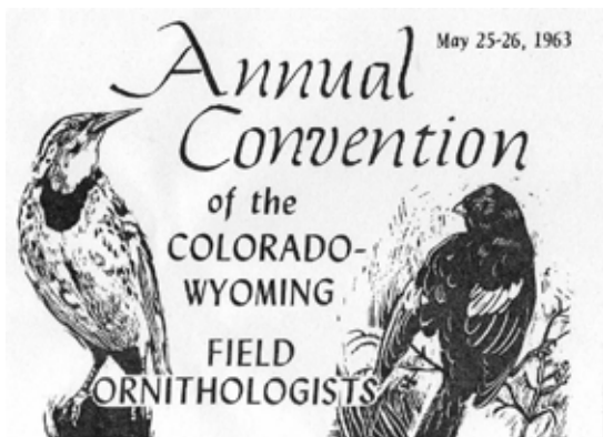
Program cover from the first CFO convention, Denver, 1963