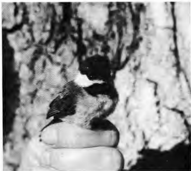
FIGURE 1. Hybrid chickadee at 18 days of age, showing a small white "comma" above the eye.