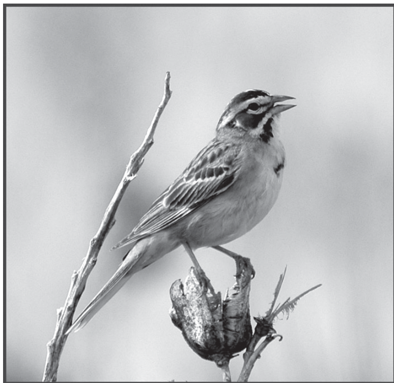
Lark Sparrow singing along the Devil's Backbone near Loveland in May 2004.