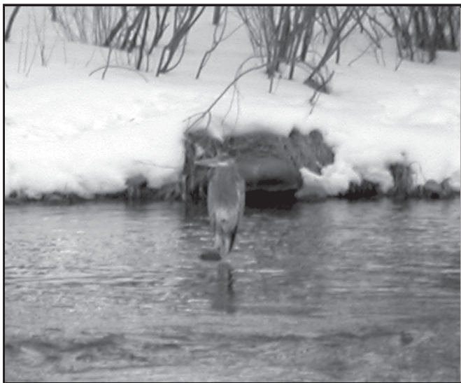
Great Blue Heron standing in the Blue River in Silverthorne, Summit , on 30 January 2004.