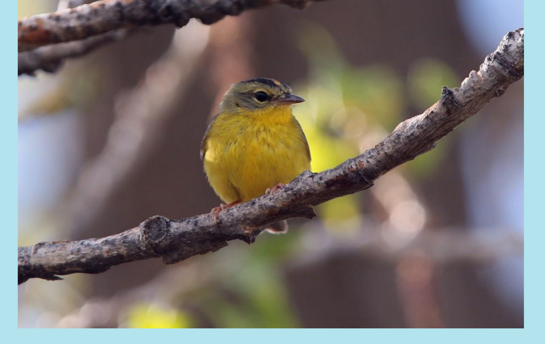
Golden-crowned Warbler, 15-18 May 2018, Cheyenne County.