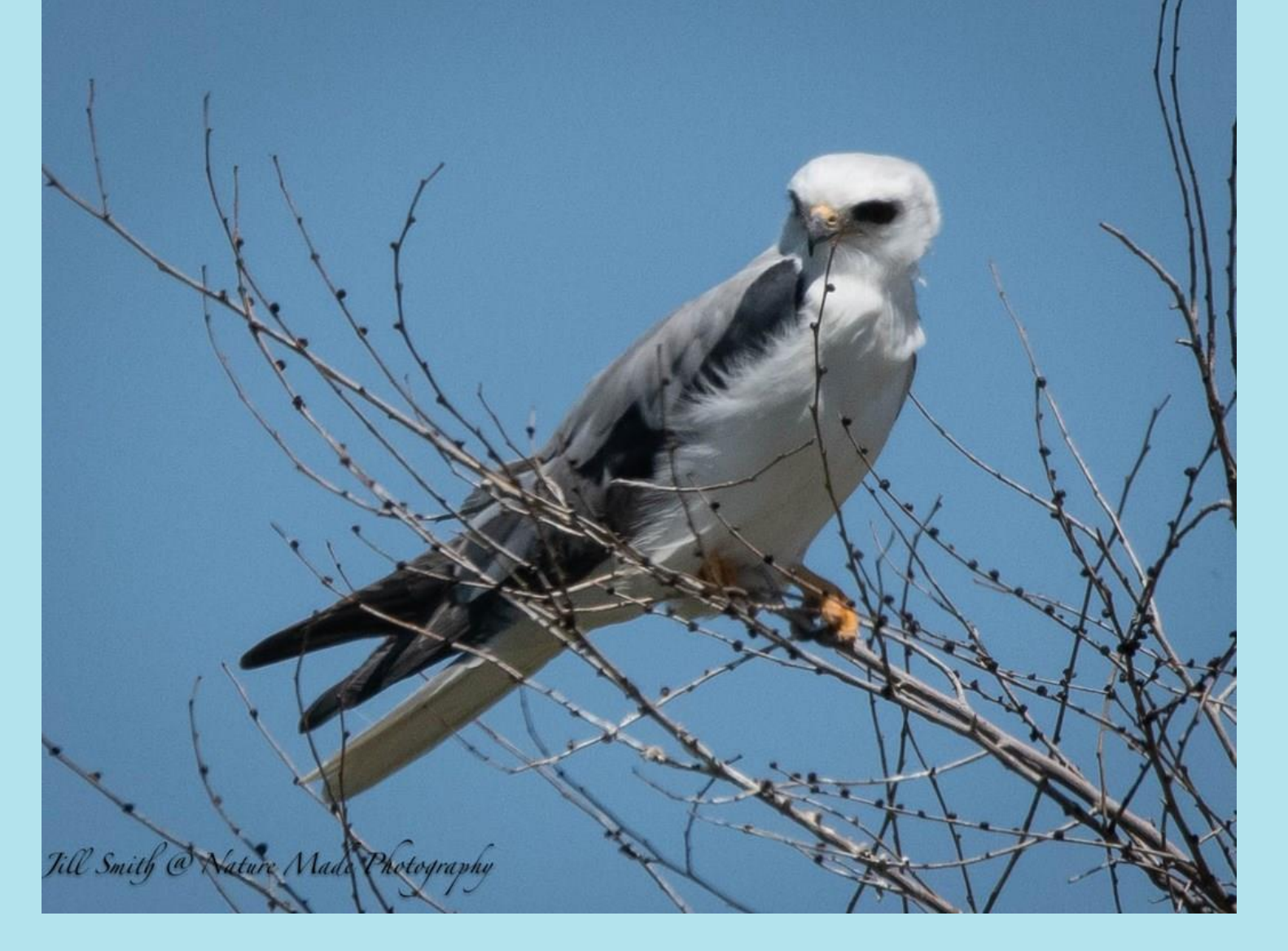
White-tailed Kite, 27 May 2019, Prowers County.